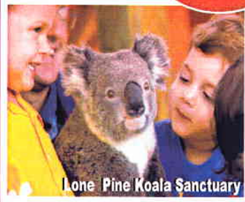
Lone Pine Koala Sanctuary

Tour Code Air AsiaX - Tangalooma * eff Sep 2010