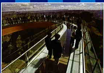
Grand Canyon West Rim - Skywalk