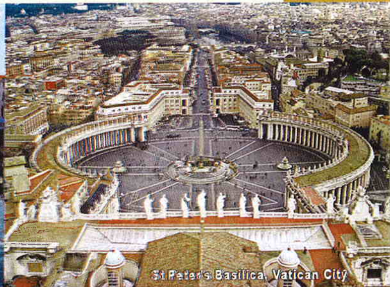
St Peter's Basilica, Vatican City